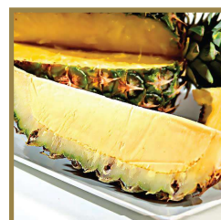
Pineapple Delight £5.95