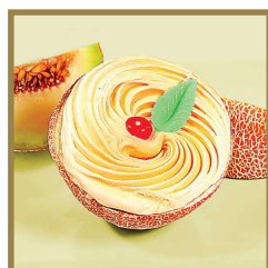
Melon Delight £4.95