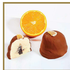
Orange Bombe £4.95