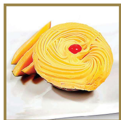
Mango Delight £4.95